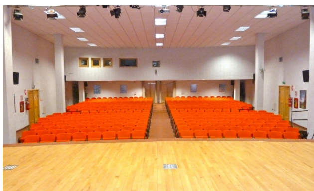
TEAM OFFICIAL MEETING ROOM: CINEMA