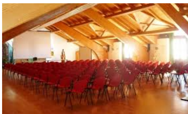
JWOC SECRETARIAT: ROOM PINE' 1000