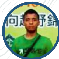
Chobra Kumbara S PP FONI