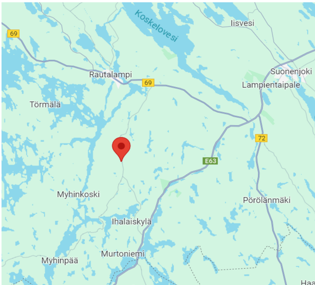
General map of the region and the embargoed area

The distance from the parking lot to the competition center is approximately 2-2.5 kilometers.