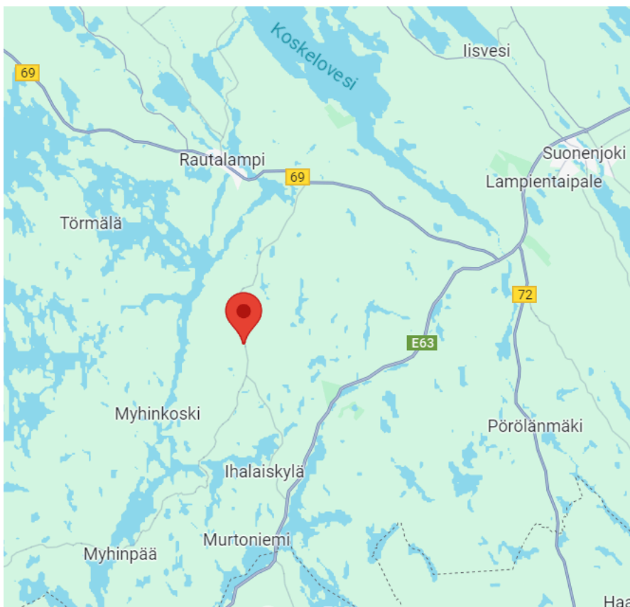
General map of the region and the embargoed area

The distance from the parking lot to the competition center is approximately 2-2.5 kilometers.