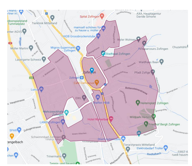
Embargoed area Zofingen