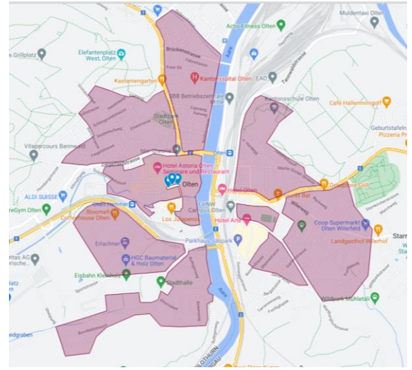
Embargoed area Olten