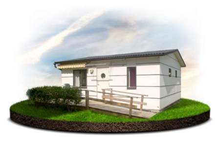
'CITYSPRINT' when booking)