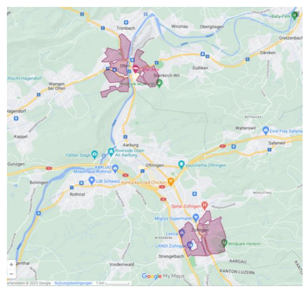
Embargoed area around in Olten