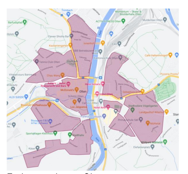
Embargoed area Olten