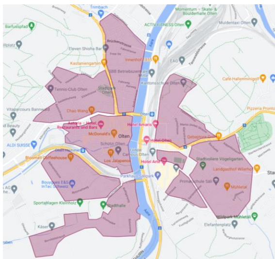
Embargoed area Olten