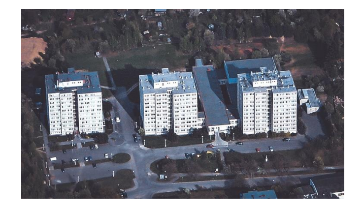
Building of the university dormitories Lochotín

At the Event Centre there will be rooms for: