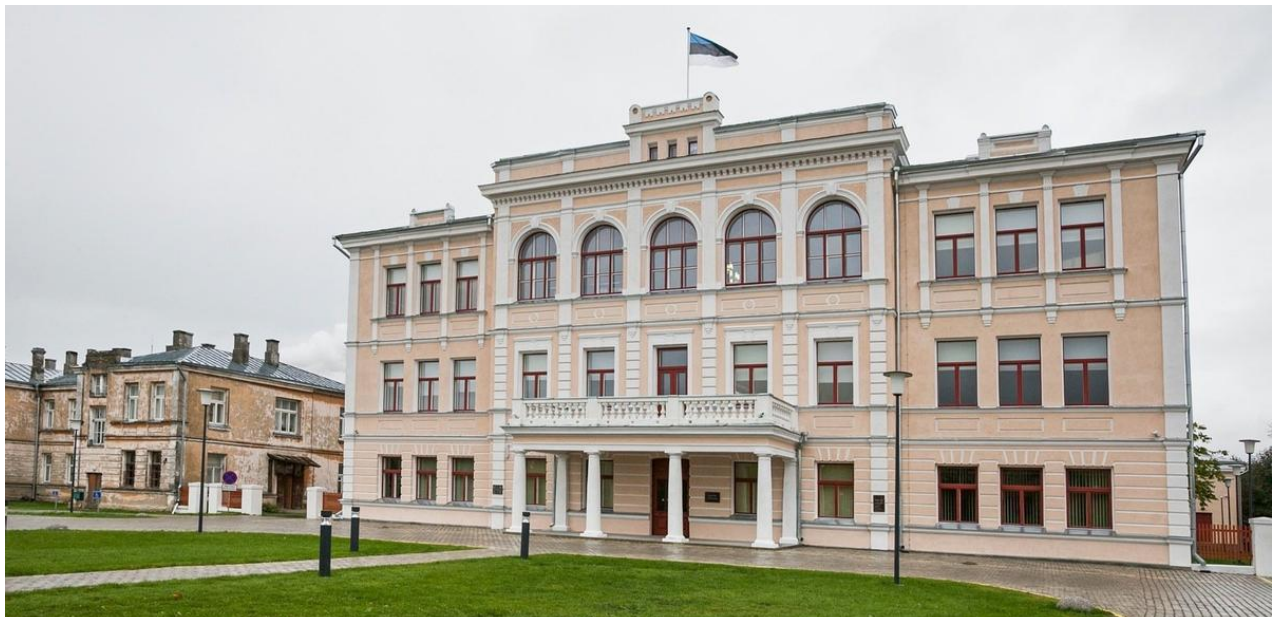
Rakvere Vocational School.

There is free Wi-Fi and parking in the Event Centre.