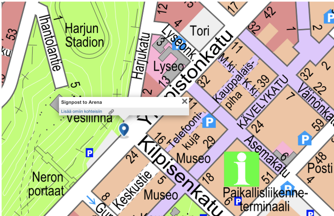
General map of the region and the embargoed area