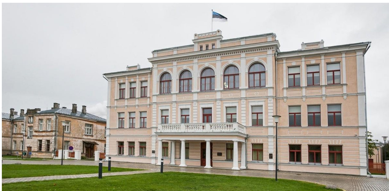
Rakvere Vocational School (photo: Raivo Tasso).

The Event Centre will provide the following facilities: Event Office, Media Centre, toilets, free Wi-Fi access and parking.