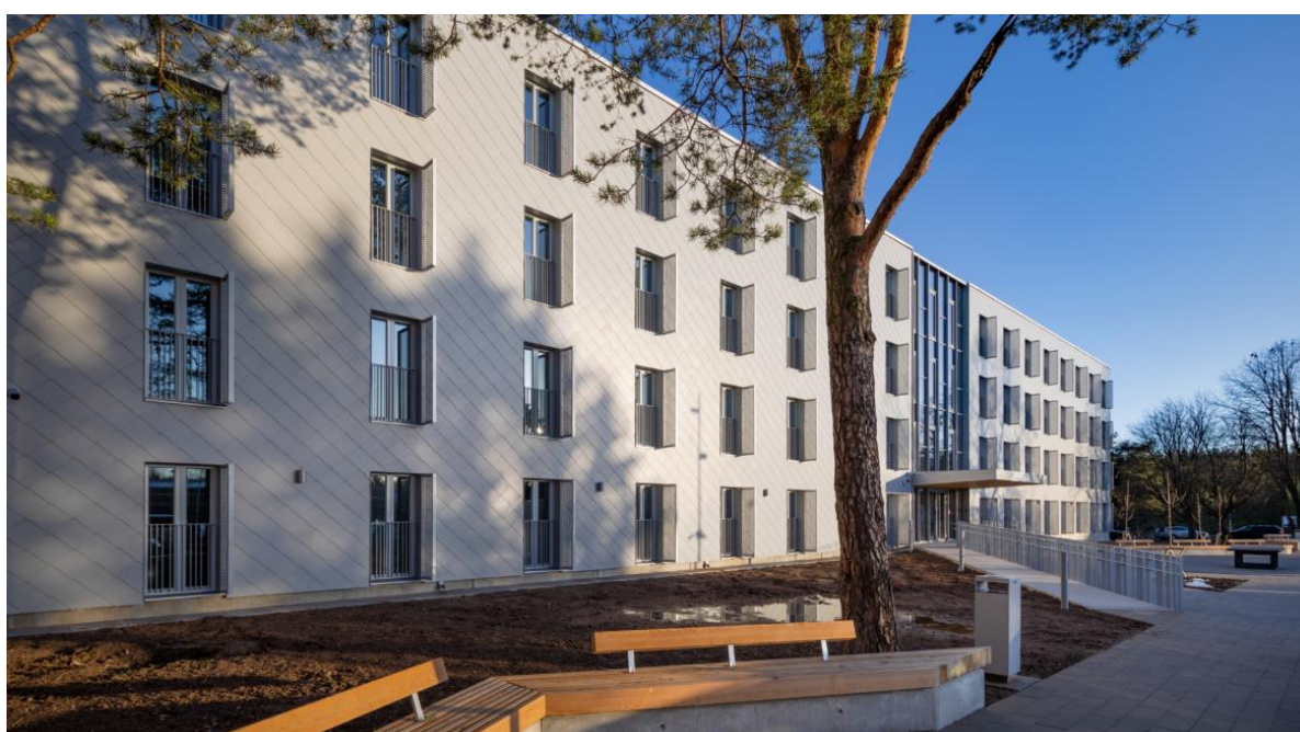
Dormitory of Rakvere Vocational School.

Catering service will be provided in the arenas.