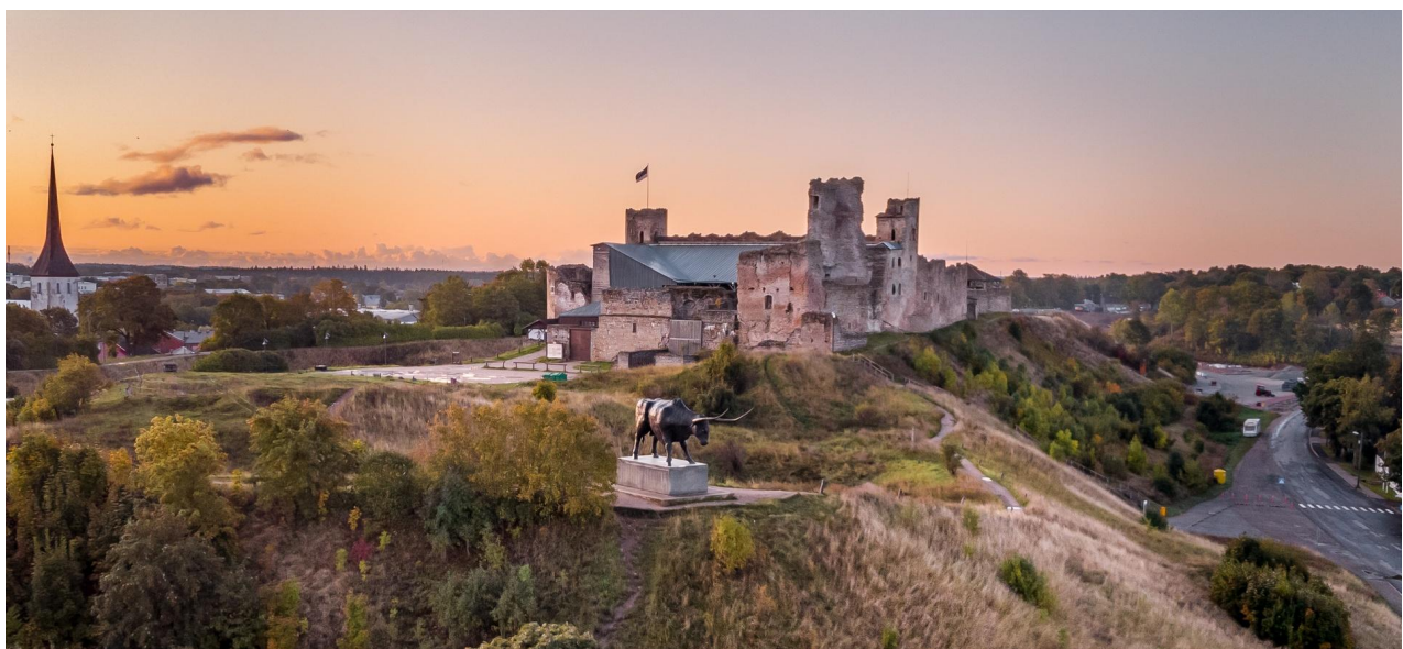
Rakvere Castle (photo: Simo Sepp).