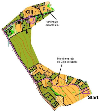
Pajac - Finish and start area