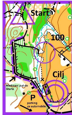
Ravna gora - Finish area