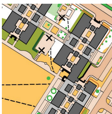
Sample of Arena map