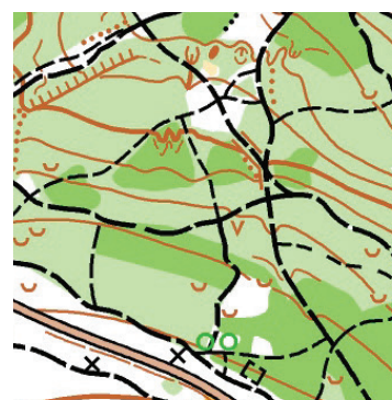
Sample of Košutnjak map