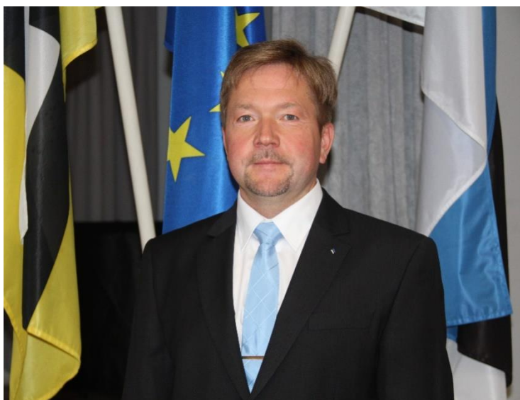
The Head of Council – Chairman

We are waiting for you to discover the possibilities of Otepää and enjoy the beautiful nature!