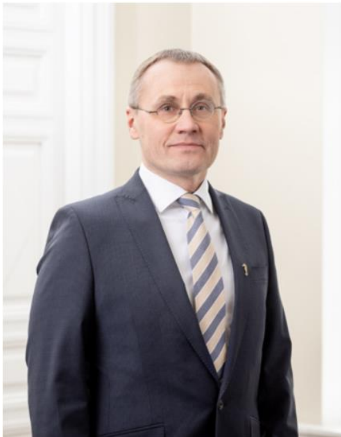
Minister of Culture