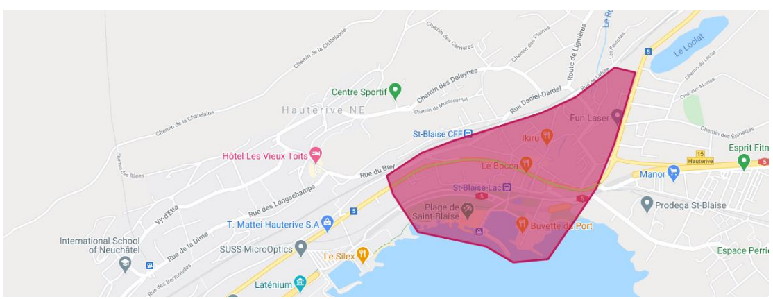
Embargoed area St-Blaise