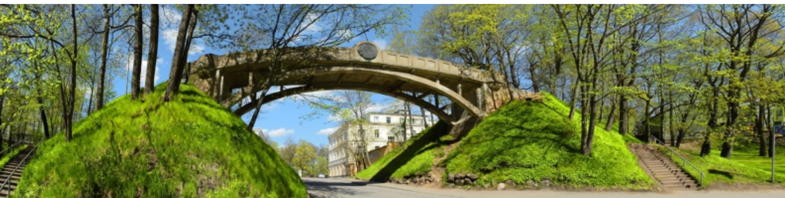
Devil's bridge in Tartu

The Competition Rules for IOF Foot Orienteering Events will be applied to participation in the Nokian Tyres World Orienteering Championships 2017. There is one class for women and one class for men, there are no age restrictions.