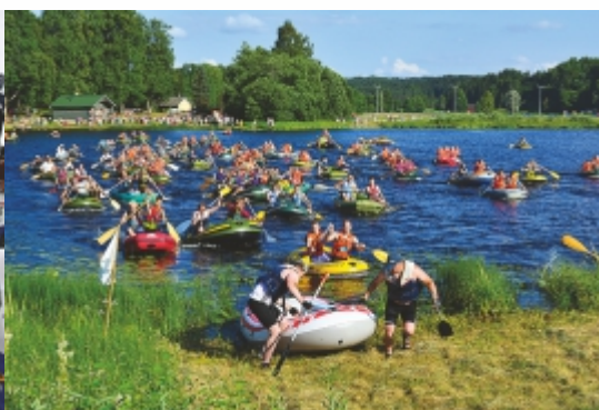
Annual boatrace in the beginning of July on five lakes, including the deepest in Estonia