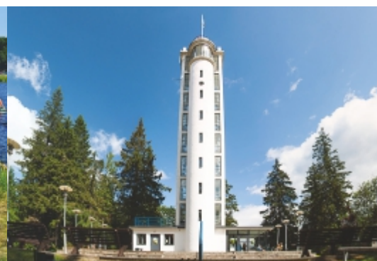
Highest point in the Baltic states