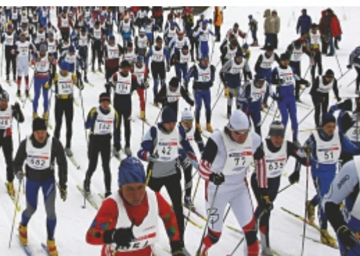
Haanja cross-country skiing marathon in the beginning of March