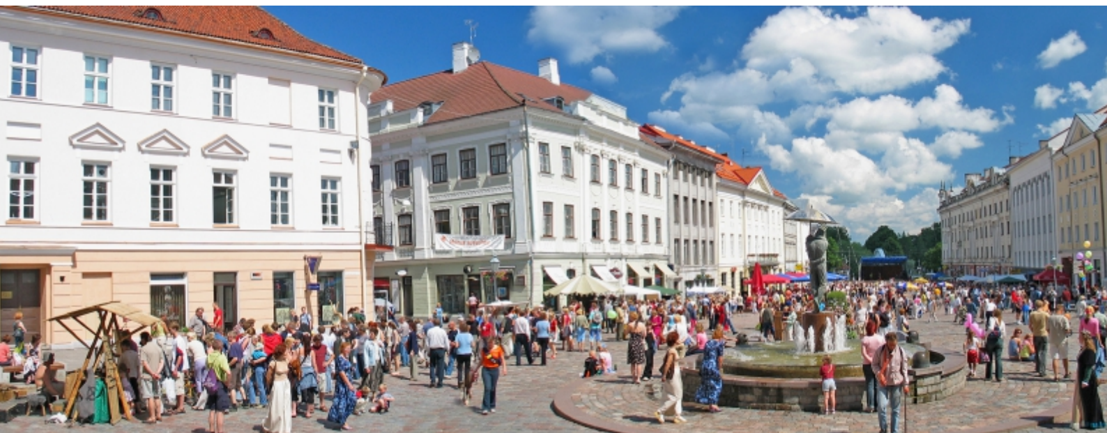
The city of Tartu