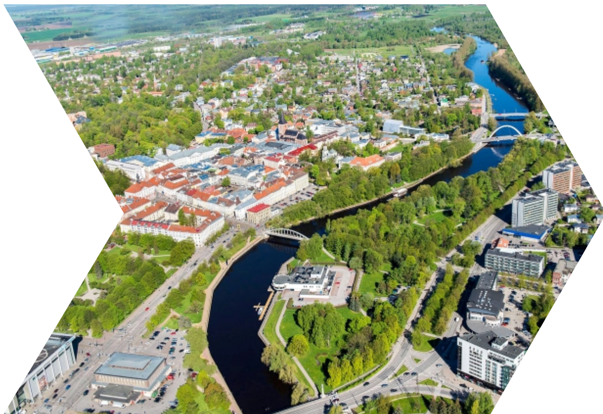
The city of Tartu / Author: Margus Vilisoo