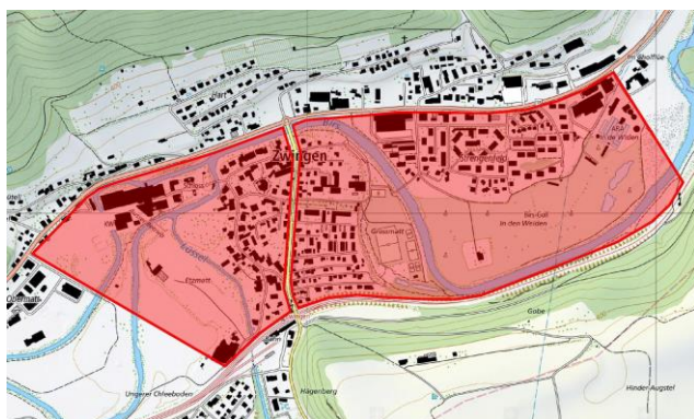
Embargoed areas Zwingen