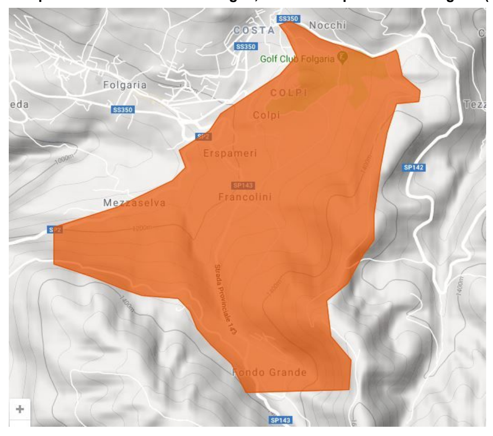
Saturday 7<sup>th</sup> September 2019 - Italian Championship SPRINT WRE - Folgaria (TN)