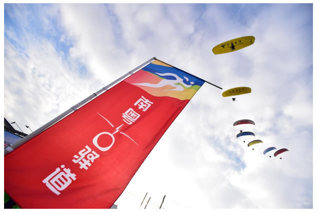
Guangdong Telecom wins the strategic partnership of the event for the second time since 2017, with the title sponsorship of "Surfing IPTV" Cup for this year. To

Running in parallel with the event is an Aero-Orienteering and an Archery Tag, one of the most novel and popular outdoor activities in recent years, while the Aero-Orienteering is the first event of its kind in China.