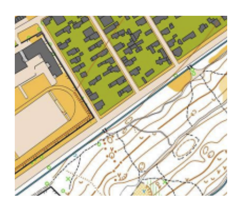
NIGHT / НОЩНО

Lions Club, Baden-Heitersberg (Switzerland)