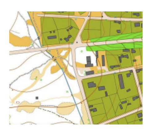
SPRINT / CПРИНТ