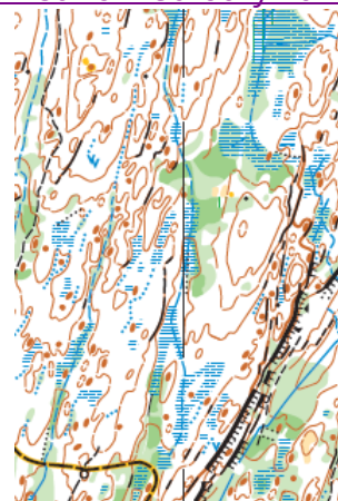
Map sample from Kirkebygda