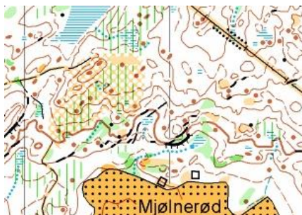
Map sample from Moltemosen