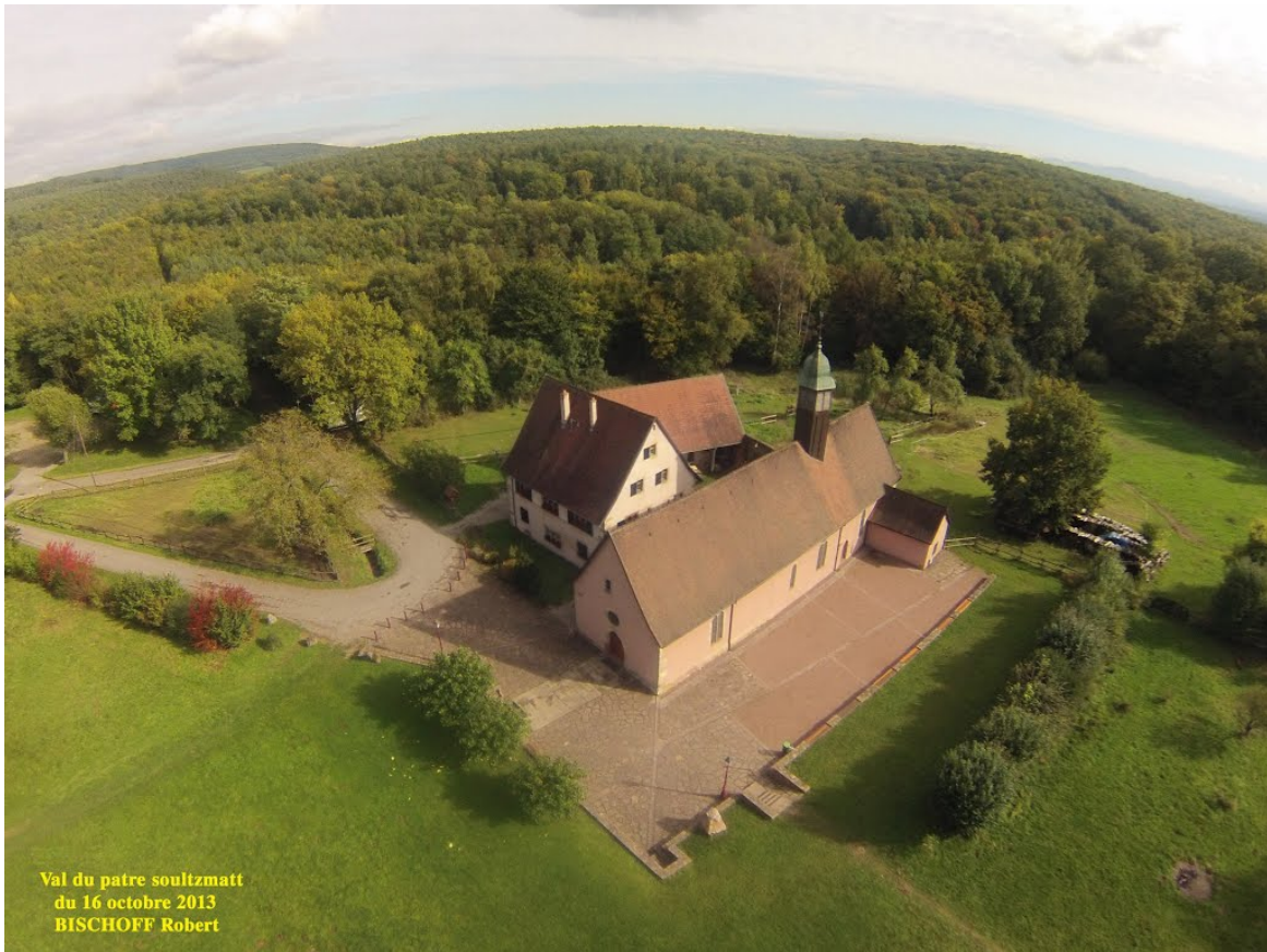
Val du patre soultzmatt du 16 octobre 2013 BISCHOFF Robert

Training : 15/05 - CFMD (WRE) : 16/05 & CFC : 17/05/2015