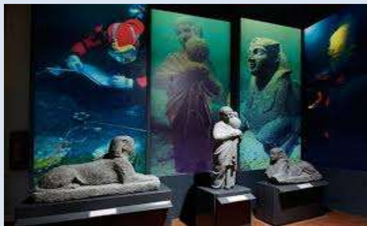
Alexandria National Museum