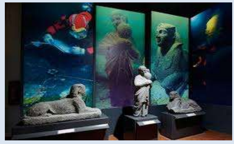
Alexandria National Museum