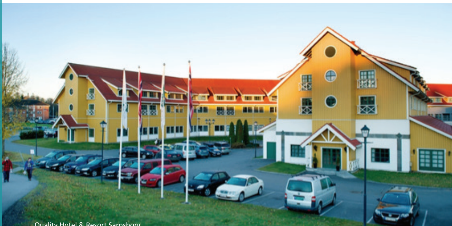
Quality Hotel & Resort Sarpsborg