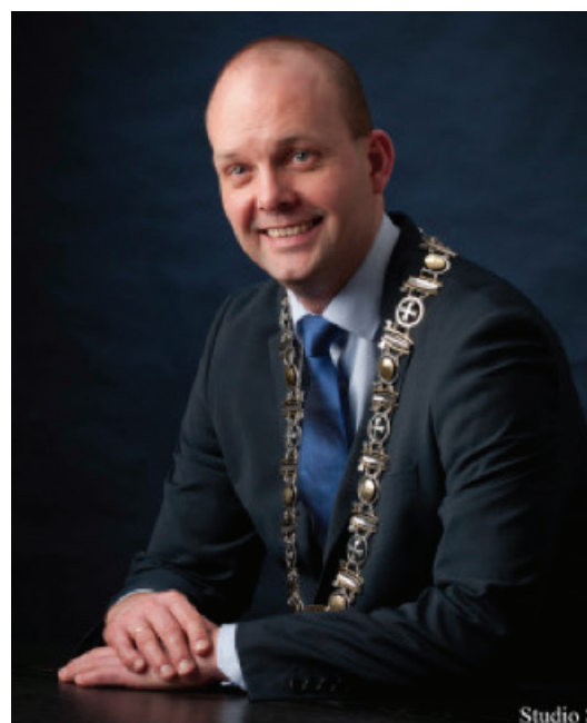
Sindre Martinsen-Evje Mayor of Sarpsborg Municipality

Sarpsborg look forward to see you all in 2019!