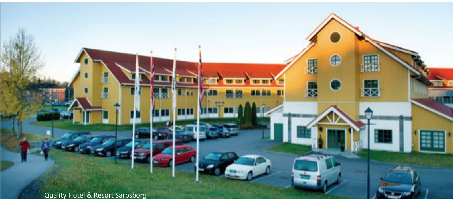
Quality Hotel & Resort Sarpsborg