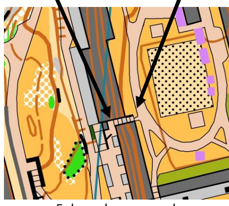
Enlarged map sample